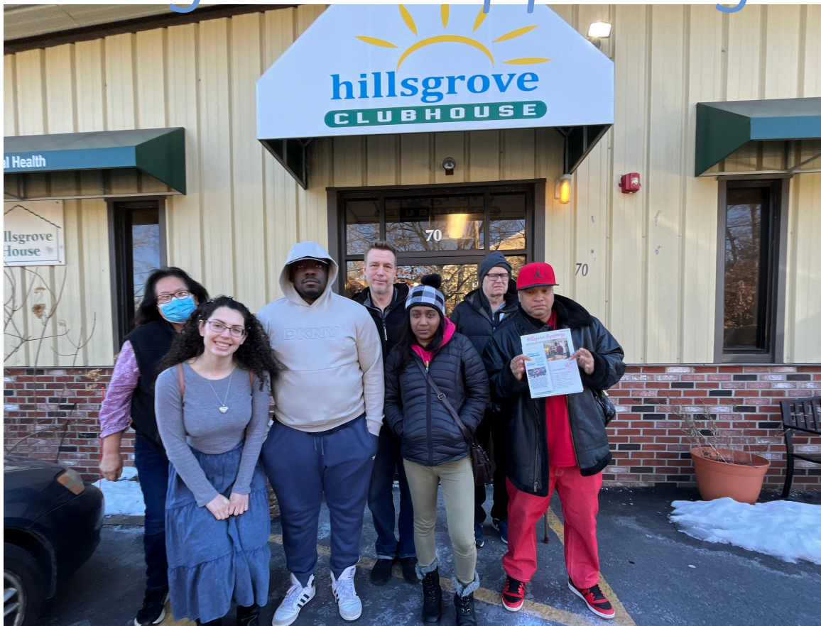
Our friends from Webster House